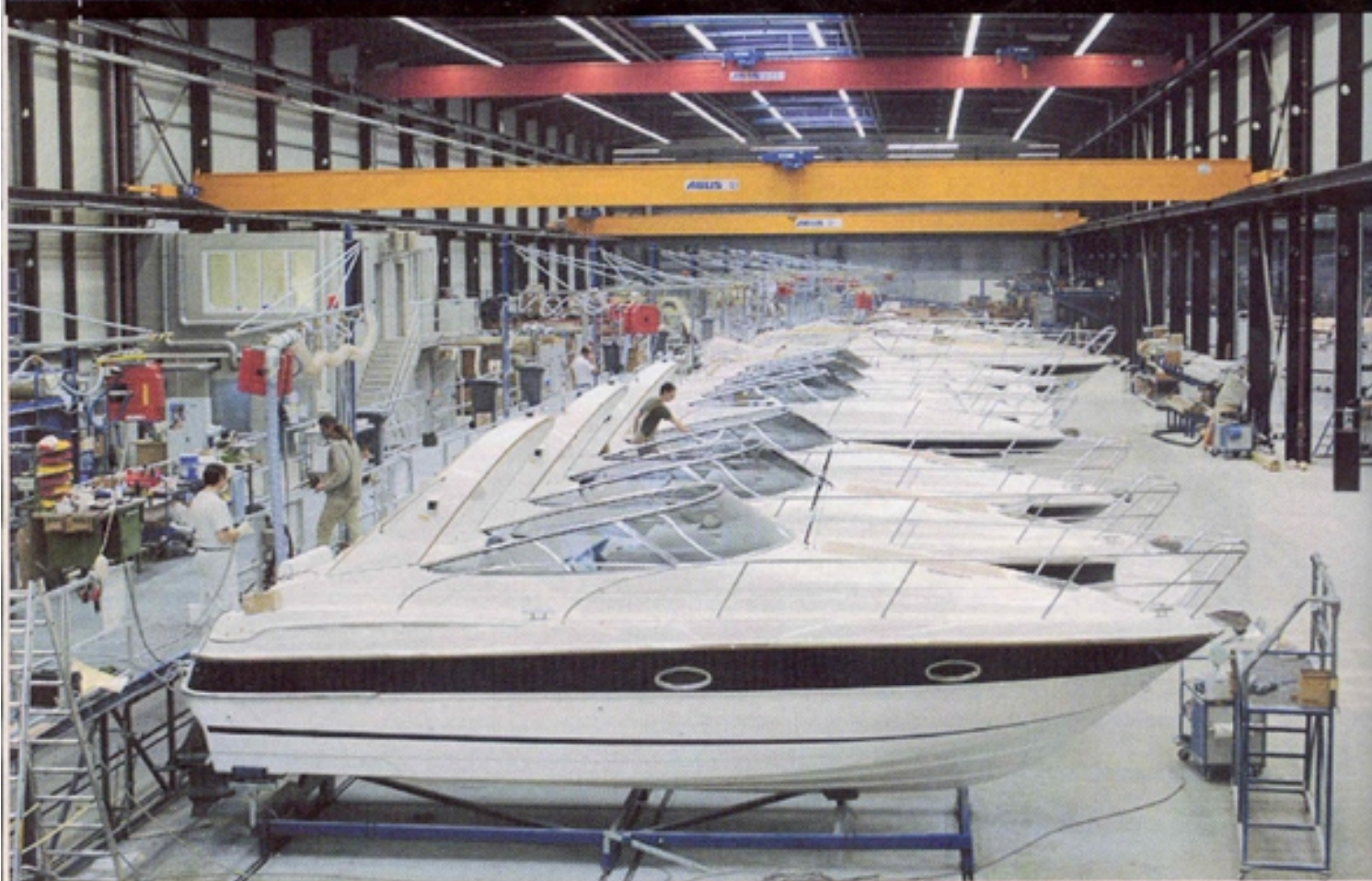
At station 30, the final stage, the boats are given their final touches and last pre-delivery inspection.

and hatches can be done upfront and then fully mounted at a later stage when the hull and deck merger is completed. Parallel to deck production, the corresponding hull is placed on the assembly line. The production line procedures are scheduled down to the finest detail and divided into assembly volumes which are simple to survey independently.