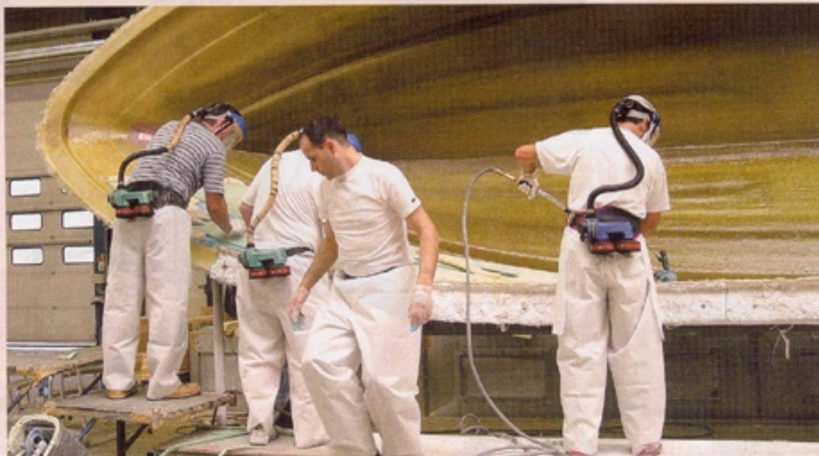
Before the Bavaria boats are loaded onto the conveyor rails, the hull is expertly prepared.

Bavaria produces motor boats by means of assembly lines consisting of specialized assembly stations. Hulls and decks are transferred between specific assembly stations via a rail transport system. With the conveyor production system, the installation of the deck fittings